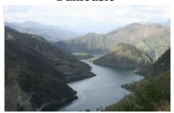
For more information, <u>click here</u>.